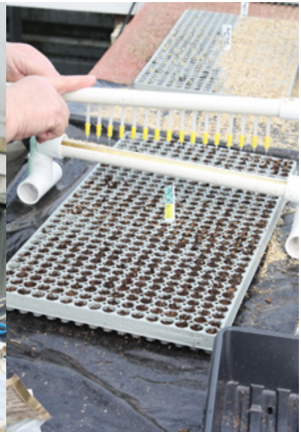
Brenda demonstrates a seedling planter she won at a trade show. The tool uses an air pump, various needles based on seed size, and a suction release mechanism to grab and plant each seed.

seven traditional greenhouses devoted to flowers and vegetables, one high-tunnel greenhouse reserved primarily for tomatoes, a 1.5-acre market garden for produce, and a 2-acre pumpkin plot.